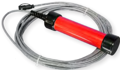
OPTIONAL REMOTE ANTENNA (TRAXALL 501)