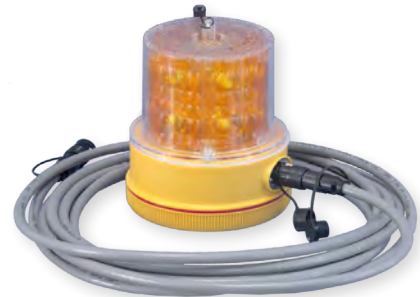
OPTIONAL REMOTE FLASHER (TRAXALL 501)